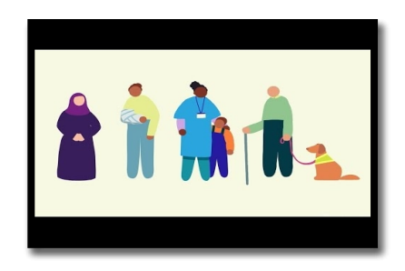
NHS England: Strong Integrated Care Systems Everywhere

King's Fund animation: how the NHS works and how it is changing